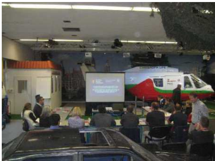
Picture: PALS-AHA-COURSE in Johanniter Simulation Area